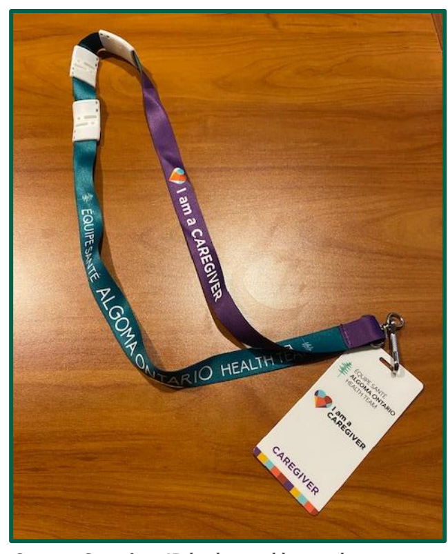
Custom Caregiver ID badge and lanyard.

This project also has the added benefit of the provision of education to staff regarding the role and value of essential care partners and their safe re-entry as partners in care.